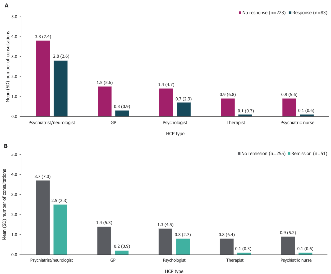
Fig. 2. Mean number of outpatient HCP consultations between baseline and Month 6 (excluding baseline and Month 6 visits). A. Mean outpatient consultations stratified by response at Month 6. B. Mean outpatient consultations stratified by remission at Month 6. Response: MADRS improvement from baseline \geq 50\% or MADRS score >10 ; remission: MADRS score \leq 10 . GP: general practitioner; HCP: healthcare practitioner; MADRS: Montgomery-Åsberg Depression Rating Scale; SD: standard deviation.

With regards to number of consultations, from baseline to Month 6 non-responders accessed all types of healthcare professionals with a greater mean frequency than responders. Non-responders accessed on average (mean [SD]) five times as many consultations with a GP (1.5